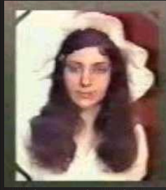
Rita committed suicide